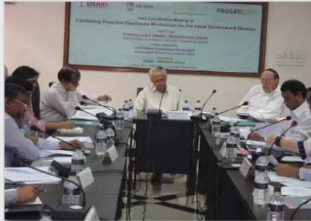
Second Joint Collaboration Meeting between the Information Commission and the LGD

developed their own disclosure policies and 30 of them have been approved by their Executive Committees. At the same time PROGATI, through its partner MRDI, is providing training to CSOs and the field level journalists on better understanding of RTI and on submitting RTI requests. After receiving training 26 RTI requests have been submitted by the journalists and 66 have been submitted by the CSOs.