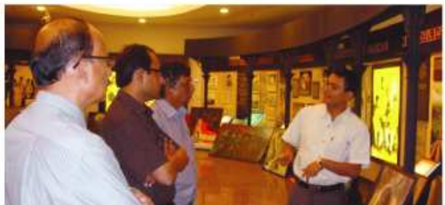
Tata official explaining history of Tata's CSR to the visiting team at the Centre for Excellence

sanitation, education, empowerment and environment. In carrying out its CSR programmes, Tata Steel operates its CSR activities in 896 villages covering 18 districts of three states.