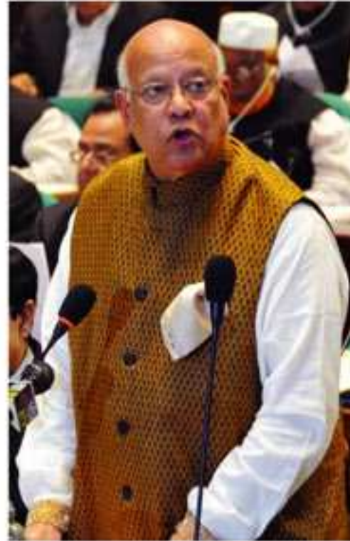
Honorable Finance Minister Abul Maal Abdul Muhith in his budget speech in the Parliament on June 9, 2011

"Restructuring the fields of Corporate Social Responsibility (CSR) has been proposed to encourage CSR compliance. Moreover, company taxpayers' will be eligible to get 10 percent tax rebate for CSR donation up to Tk. 8 crores subject to a limit of 20 per cent of their income. I also propose to raise the limit for expenditure for tax rebate to Tk. 1 crore to encourage individual investment. I also propose to rationalise and expand the scope of CSR."